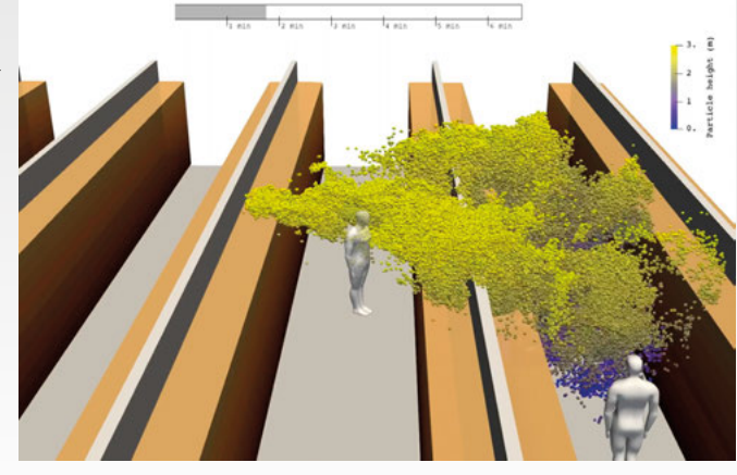
A joint Finnish research project led by Aalto University has investigated the transport and spread of the coronavirus by air. The researchers modeled a scenario in which a person coughs in a corridor between shelves, such as that found in grocery stores, taking ventilation into account. Preliminary results suggest that aerosol particles that carry the virus may remain in the air longer than originally thought. In the 3D model, a person coughs in a corridor delimited by shelves under representative indoor air flow conditions. As a result of the cough, an aerosol cloud travels to the corridor in the air. It takes up to several minutes for the cloud to spread and scatter.